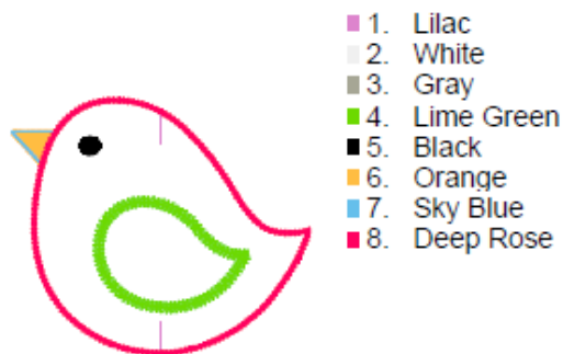
Birdieclippiekeeper 5x7 Small.pes 121.90x106.10 mm; 2,885 stitches 8 thread changes; 8 colors