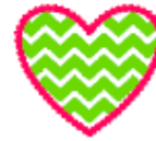
Heart 45mm One Colour Group.pes 45.10x99.40 mm; 3,697 stitches 6 thread changes; 3 colors