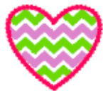
Heart 45mm Two Colour Group.pes 45.00x99.50 mm; 3,737 stitches 8 thread changes; 4 colors