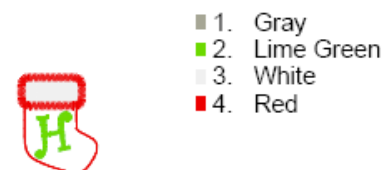
H-Stocking-Right.pes 34.70x43.40 mm; 1,976 stitches 4 thread changes; 4 colors