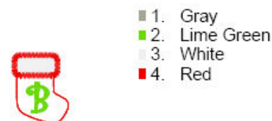
B-Stocking-Right.pes 34.70x43.40 mm; 1,907 stitches 4 thread changes; 4 colors