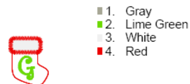
G-Stocking-Right.pes 34.70x43.40 mm; 2,031 stitches 4 thread changes; 4 colors