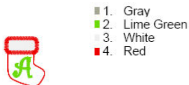
A-Stocking-Right.pes 34.70x43.40 mm; 1,932 stitches 4 thread changes; 4 colors