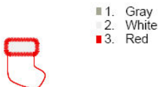
Blank-Stocking-Right.pes 34.60x43.40 mm; 1,471 stitches 3 thread changes; 3 colors