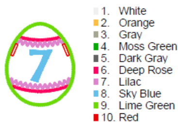
7-Egg5x7small.pes 105.60x128.20 mm; 5,780 stitches 10 thread changes; 10 colors