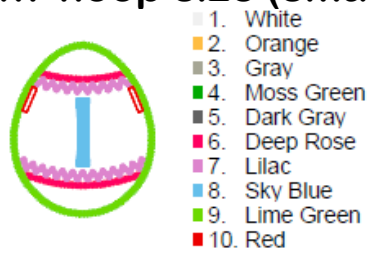
1-Egg5x7small.pes 105.60x128.20 mm; 5,249 stitches 10 thread changes; 10 colors