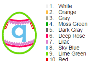
9-Egg5x7small.pes 105.60x128.20 mm; 7,002 stitches 10 thread changes; 10 colors