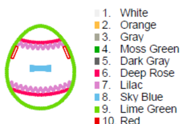
Aa-Hyphen-Egg5x7small.pes 105.60x128.20 mm; 4,826 stitches 10 thread changes; 10 colors