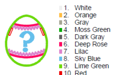
Aa-Questionmark-Egg5x7small.pes 105.60x128.20 mm; 6,039 stitches 10 thread changes; 10 colors