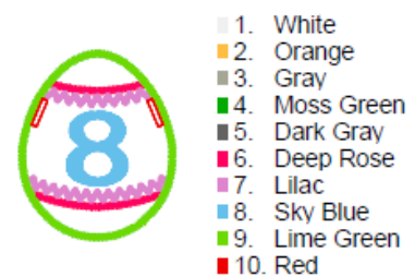
8-Egg5x7small.pes 105.60x128.20 mm; 7,192 stitches 10 thread changes; 10 colors