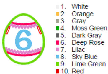
6-Egg5x7small.pes 105.60x128.20 mm; 6,987 stitches 10 thread changes; 10 colors