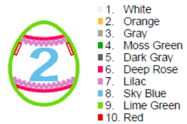
2-Egg5x7small.pes 105.60x128.20 mm; 6,644 stitches 10 thread changes; 10 colors