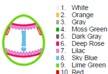
Aa-Exclamation-Egg5x7small.pes 105.60x128.20 mm; 5,269 stitches 10 thread changes; 10 colors