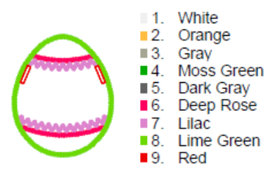
Aa-Blank-Egg5x7small.pes 105.60x128.20 mm; 4,158 stitches 9 thread changes; 9 colors