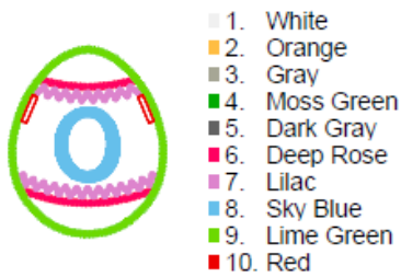
0-Egg5x7small.pes 105.60x128.20 mm; 6,781 stitches 10 thread changes; 10 colors