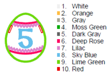
5-Egg5x7small.pes 105.60x128.20 mm; 6,718 stitches 10 thread changes; 10 colors