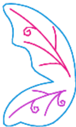
Fairywing Left 75mm.pes 44.90x75.00 mm; 1,040 stitches 4 thread changes; 4 colors