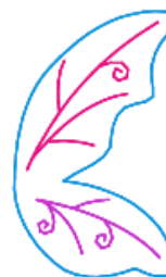
Fairywing Right 75mm.pes 44.90x75.00 mm; 1,040 stitches 4 thread changes; 4 colors