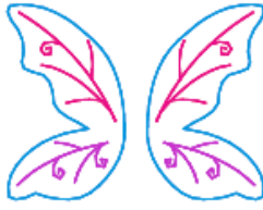
Fairywing Both 55mm Sorted 4x4.pes 72.20x55.00 mm; 1,633 stitches 4 thread changes; 4 colors