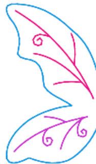
Fairywing Left 95mm.pes 57.00x95.00 mm; 1,274 stitches 4 thread changes; 4 colors