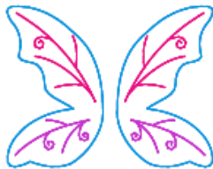
Fairywing Both 95mm Sorted 5x7.pes 122.20x95.00 mm; 2,550 stitches 4 thread changes; 4 colors