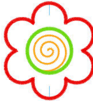
Flowerclippiekeeper 4x4.pes 90.40x98.00 mm; 3,116 stitches 8 thread changes; 6 colors