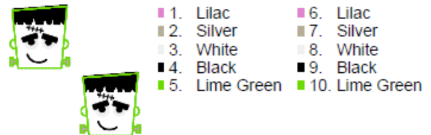
Frankie 45mm Group.pes 98.20x98.40 mm; 5,583 stitches 10 thread changes; 5 colors