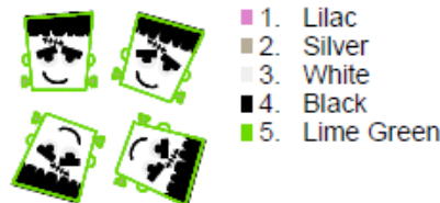
Frankie 35mm Sorted.pes 90.20x91.00 mm; 7,891 stitches 5 thread changes; 5 colors