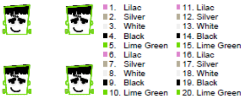
Frankie 30mm Group.pes 96.10x95.10 mm; 6,759 stitches 20 thread changes; 5 colors

by GG Designs Embroidery Stitch count and colour chart