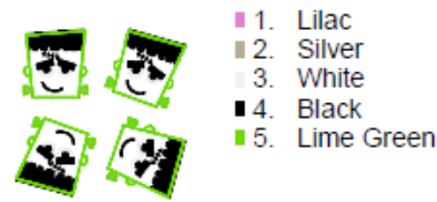
Frankie 30mm Sorted.pes 78.50x77.80 mm; 6,707 stitches 5 thread changes; 5 colors