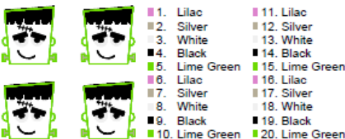
Frankie 40mm Group.pes 98.70x98.10 mm; 9,695 stitches 20 thread changes; 5 colors