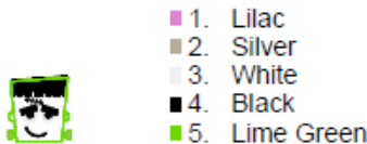
Frankie 30mm.pes 29.80x31.50 mm; 1,689 stitches 5 thread changes; 5 colors