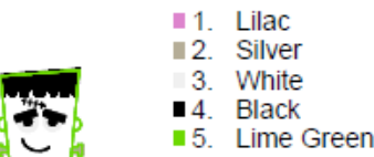
Frankie 40mm.pes 40.00x42.20 mm; 2,423 stitches 5 thread changes; 5 colors