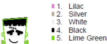
Frankie 45mm.pes 45.00x47.70 mm; 2,791 stitches 5 thread changes; 5 colors