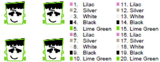
Frankie 35mm Group.pes 98.20x97.60 mm; 7,875 stitches 20 thread changes; 5 colors