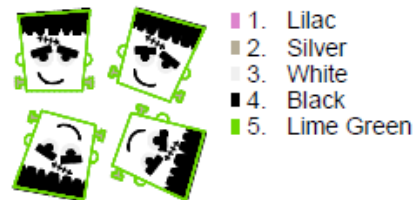
Frankie 40mm Sorted.pes 98.80x99.40 mm; 9,680 stitches 5 thread changes; 5 colors