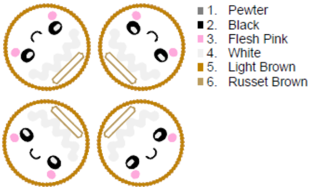
Gingerbreadbagtopper 4x4 Sorted.pes

by GG Designs Embroidery Stitch count and colour chart