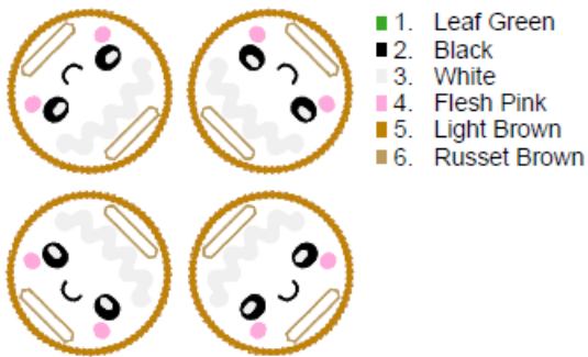
Gingerbreadslider 4x4 Sorted.pes 99.80x99.80 mm; 8,322 stitches 6 thread changes; 6 colors