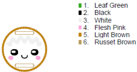
Gingerbreadslider.pes 47.20x47.20 mm; 2,087 stitches 6 thread changes; 6 colors