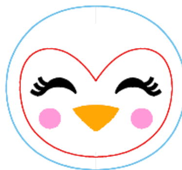
Penguinirly Clippiekeeper 5x7 Large.pes 129.80x118.60 mm; 4,188 stitches 7 thread changes; 7 colors