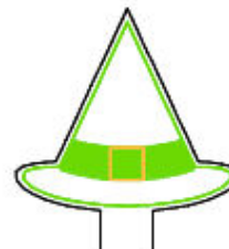
Witchhatpencil.pes 53.70x57.70 mm; 1,212 stitches 4 thread changes; 4 colors