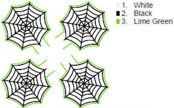
Spiderwebpencil Sorted.pes 99.40x99.30 mm; 5,955 stitches 3 thread changes; 3 colors

by GG Designs Embroidery Stitch count and colour chart