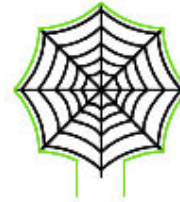
Spiderwebpencil.pes 46.00x51.30 mm; 1,493 stitches 3 thread changes; 3 colors