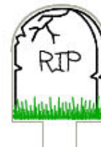
Tombstonepencil.pes 36.20x53.40 mm; 1,009 stitches 4 thread changes; 4 colors