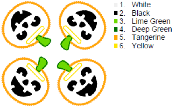
Jackbagtopper 4x4 Sorted.pes 98.00x98.60 mm; 9,798 stitches 6 thread changes; 6 colors

by GG Designs Embroidery Stitch count and colour chart