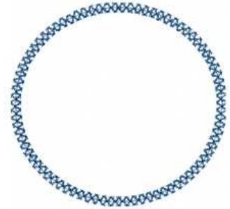
File: Circle-vintage(4inch).pes Stitches: 2921 Size: 96.6 x 96.5 mm