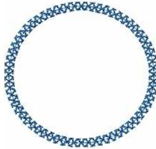
File: Circle-vintage(3inch).pes Stitches: 2261 Size: 74.9 x 74.9 mm