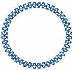
File: Circle-vintage(2inch).pes Stitches: 1570 Size: 52.6 x 52.6 mm