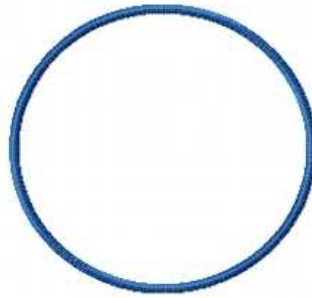
File: Circle-satin(5inch).pes Stitches: 2742 Size: 124.5 x 124.4 mm