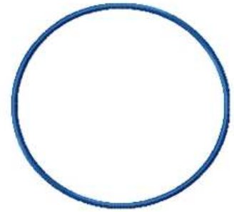
File: Circle-satin(6inch).pes Stitches: 3225 Size: 146.4 x 146.3 mm