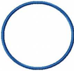
File: Circle-satin(4inch).pes Stitches: 2125 Size: 96.5 x 96.4 mm