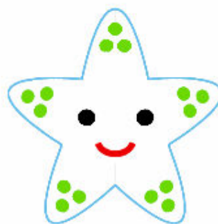
Starfishclippiekeeper 4x4.pes 99.40x99.60 mm; 3,151 stitches 5 thread changes; 5 colors