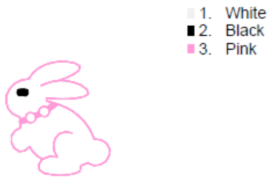
Bunnysweetbagtopper.pes 45.20x50.00 mm; 785 stitches 3 thread changes; 3 colors