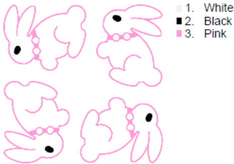
Bunnysweetbagtopper Sorted 4x4.pes 96.00x96.00 mm; 3,145 stitches 3 thread changes; 3 colors