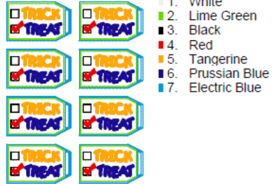
Tricktreatbagtopper 5x7 Sorted.pes 124.80x166.00 mm; 22,379 stitches 7 thread changes; 7 colors