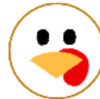
Turkeyboy 40mm.pes 40.10x40.10 mm; 1,202 stitches 5 thread changes; 5 colors