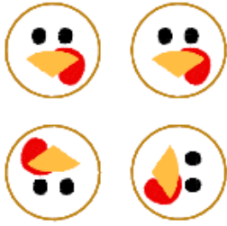
Turkeyboy 30mm Sorted.pes 70.30x69.10 mm; 3,366 stitches 5 thread changes; 5 colors