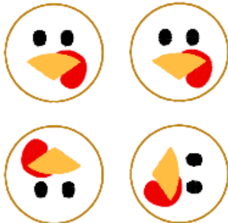
Turkeyboy 40mm Sorted.pes 91.60x90.30 mm; 4,816 stitches 5 thread changes; 5 colors