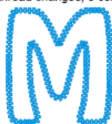
M-Gypsy(4inch).pes 85.10x93.40 mm; 5,604 stitches 3 thread changes; 3 colors