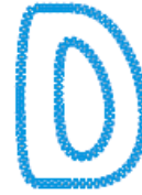
D-Gypsy(4inch).pes 66.80x93.20 mm; 4,014 stitches 3 thread changes; 3 colors