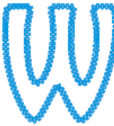
W-Gypsy(4inch).pes 90.70x93.80 mm; 5,715 stitches 3 thread changes; 3 colors