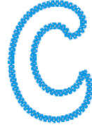
C-Gypsy(4inch).pes 66.50x96.20 mm; 3,516 stitches 3 thread changes; 3 colors