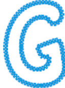
G-Gypsy(4inch).pes 68.80x95.60 mm; 4,144 stitches 3 thread changes; 3 colors