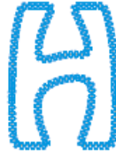
H-Gypsy(4inch).pes 69.50x92.70 mm; 4,677 stitches 3 thread changes; 3 colors