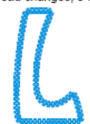
L-Gypsy(4inch).pes 55.40x92.70 mm; 2,921 stitches 3 thread changes; 3 colors