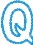
Q-Gypsy(4inch).pes 71.80x98.40 mm; 4,685 stitches 3 thread changes; 3 colors