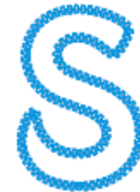
S-Gypsy(4inch).pes 65.00x95.60 mm; 4,181 stitches 3 thread changes; 3 colors