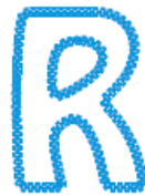
R-Gypsy(4inch).pes 67.90x92.70 mm; 4,439 stitches 3 thread changes; 3 colors