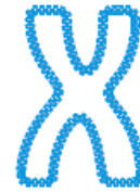
X-Gypsy(4inch).pes 65.60x92.70 mm; 4,123 stitches 3 thread changes; 3 colors