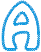
A-Gypsy(4inch).pes 71.90x94.60 mm; 4,200 stitches 3 thread changes; 3 colors