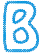
B-Gypsy(4inch).pes 65.30x93.20 mm; 4,358 stitches 3 thread changes; 3 colors