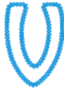
V-Gypsy(4inch).pes 66.30x93.80 mm; 3,895 stitches 3 thread changes; 3 colors