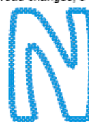
N-Gypsy(4inch).pes 68.80x92.70 mm; 4,767 stitches 3 thread changes; 3 colors